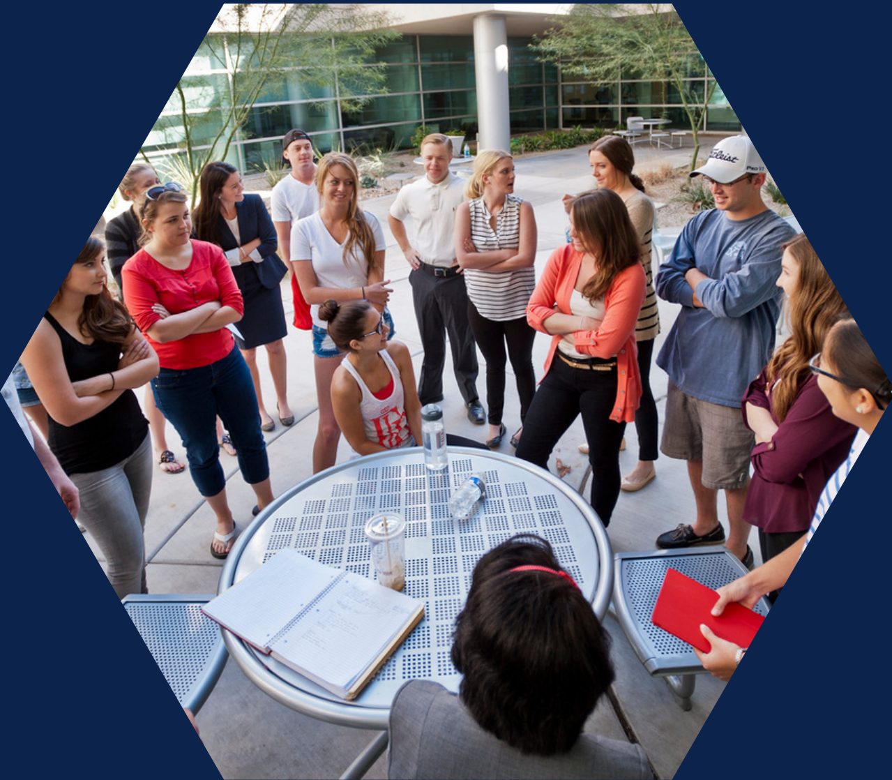
Network w/ UA Staff & Students