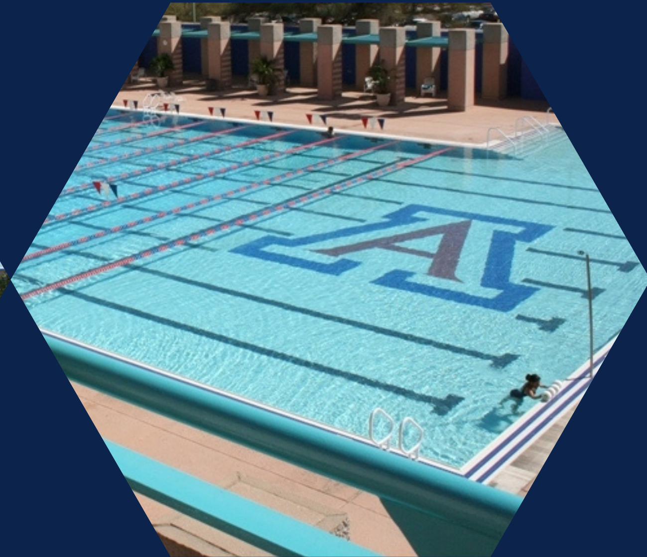
Access to Rec Center & Libraries