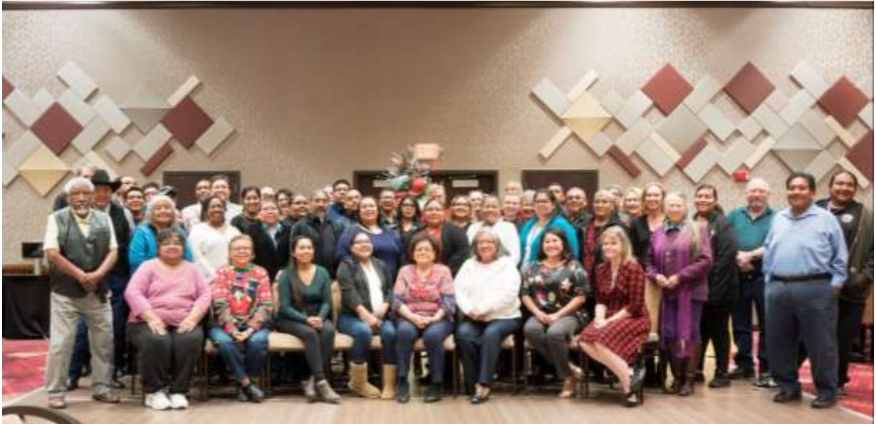
TOCC Staff & Faculty