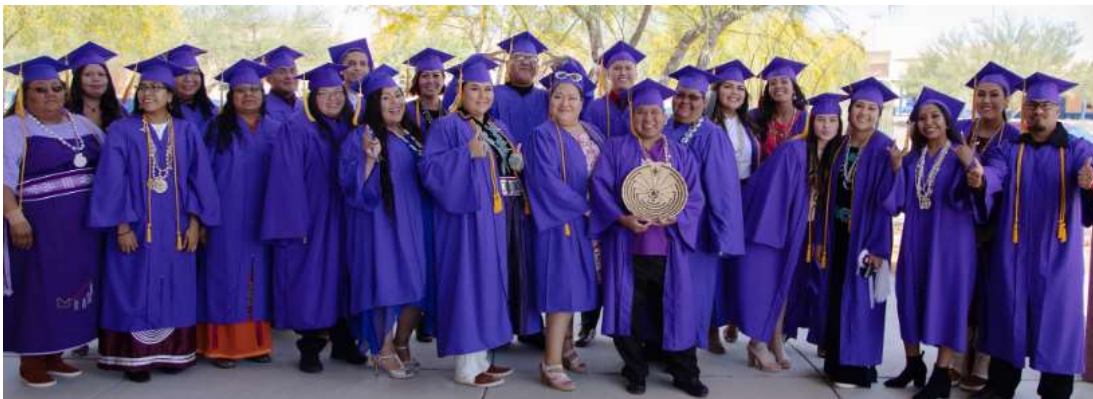
Photo: TOCC College Graduates, Class 2019

Communication includes effective reading, writing, speaking, listening, and using information technology to express ideas clearly and appropriately for different audiences. It includes artistic expression.