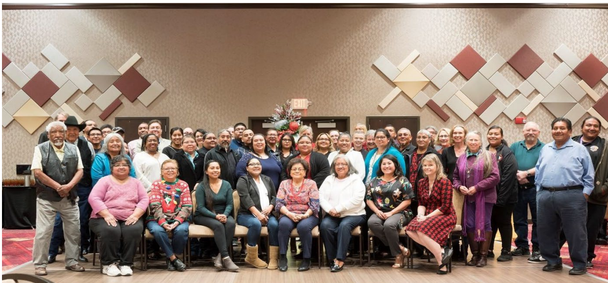
TOCC Staff & Faculty

Running a college, even a fairly small college like Tohono O’odham Community College takes a significant number of staff and faculty with a wide range of skills. This chapter includes a list of the TOCC employees who make it possible to have a college. Their names and titles are current as of March 2023. They are listed according to their roles: Board of Trustees, President, Leadership Team, Faculty, Staff, and Administration. The year in parenthesis that follows each person’s name indicates the date that employee started working for the College. The list will be updated annually in the Catalog that is posted on the TOCC website at www.tocc.edu . Adjunct faculty are listed on the TOCC website and updated each semester.