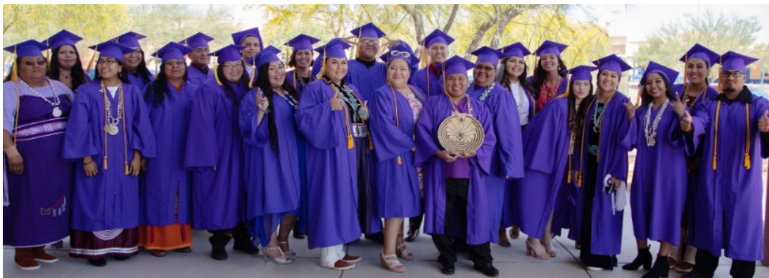
TOCC College Graduates, Class 2019

The Tohono O’odham Community College Board of Trustees approved free tuition for the O’odham Language Course. Beginning in the 2018 Summer and Fall sessions and thereafter, O’odham members from Tohono O’odham Nation can now enroll in the Tohono O’odham Language Course with free tuition. This offer is also extended to the Ak-Chin Indian Community, Gila River, and Salt River members.